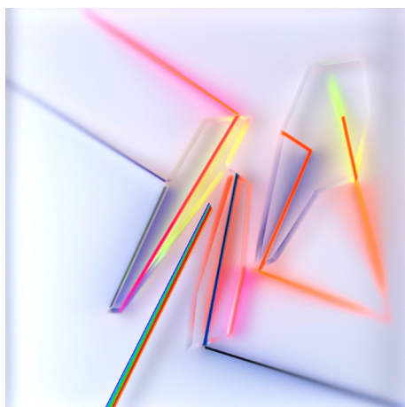
'Future Summary Sixteen', by Kal Mansur

Cube Gallery, 16 Crawford Street, London W1H 1BS